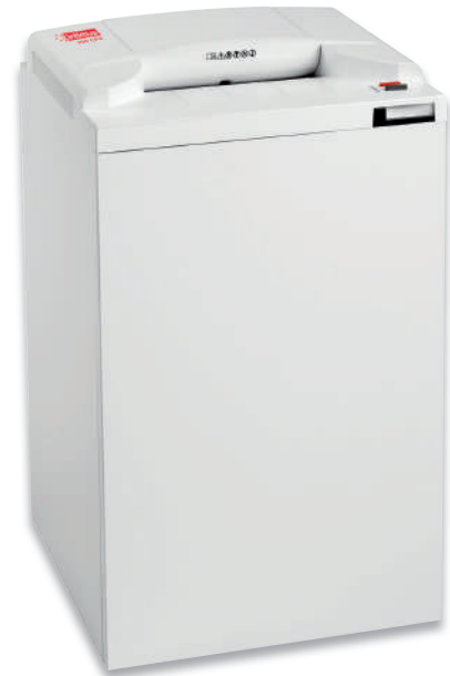
W/D/H 49 x 44 x 90 cm