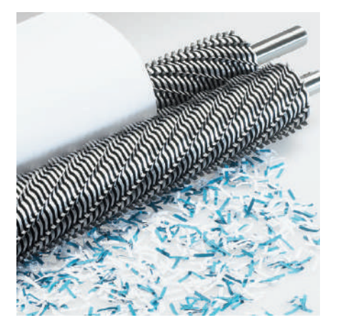
SOLID STEEL CUTTING SHAFTS

Robust and durable: high-quality paper clip proof cutting shafts with lifetime guarantee under conditions of fair wear and tear.